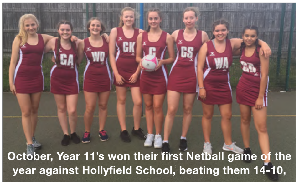
October, Year 11's won their first Netball game of the year against Hollyfield School, beating them 14-10,