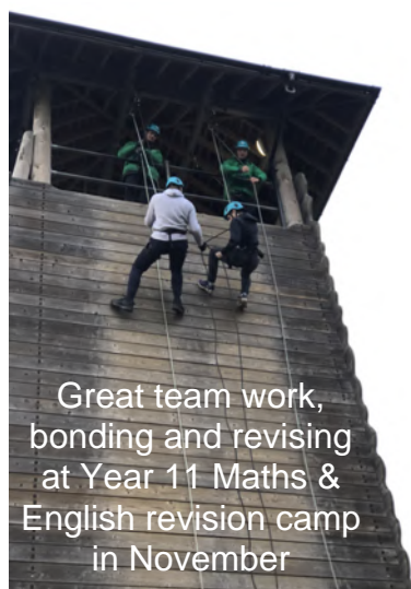
Great team work, bonding and revising at Year 11 Maths & English revision camp in November

The PTA held their annual community BBQ & Fireworks display which is always a great fundraiser for the school. Thankfully the rain held off so we could enjoy the amusements, rides and fireworks display. Thank you to everyone that helped out with the event, especially the Premises team, our lovely caterers, the PTA ladies and those that donated a raffle prize.