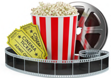
Reward - Popcorn & Movie for Streak Weeks