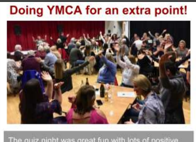
The quiz night was great fun with lots of positive feedback given for more events to take place.

The scores out of 150 total were: 1st: The Cool Dudes / 124.5 2nd: Periodic Table Dancers / 120 3rd: Old Contemptibles / 118.5 4th: And in Last Place / 110.5 5th: Lords of Lovelace / 109 6th: Wishful's / 90.5 7th: Who's the Daddy / 84.5